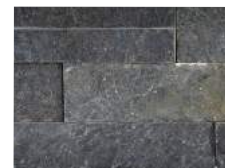
Charcoal Cool, Subdued