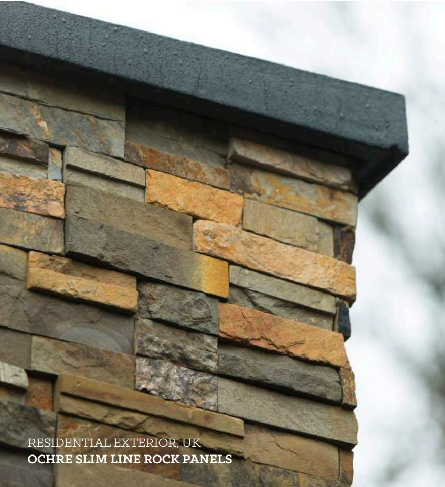
RESIDENTIAL EXTERIOR, UK OCHRE SLIM LINE ROCK PANELS