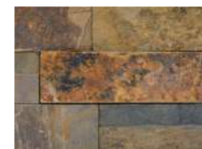
Ochre Rustic, Rugged Appeal