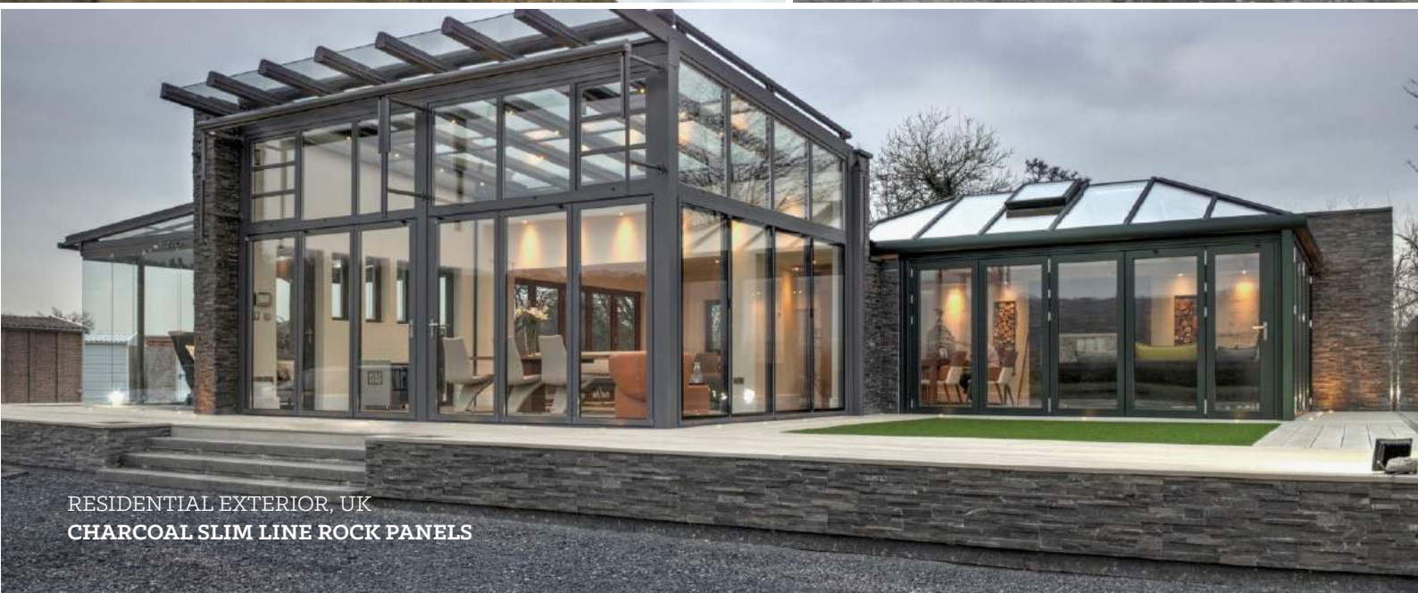
RESIDENTIAL EXTERIOR, UK CHARCOAL SLIM LINE ROCK PANELS