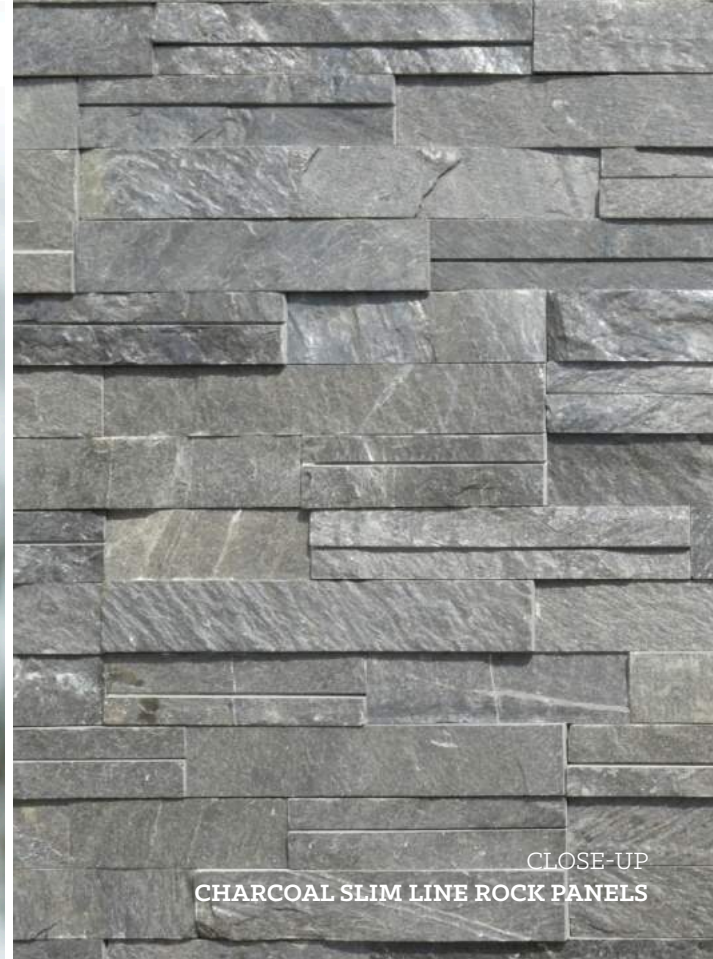
CLOSE-UP CHARCOAL SLIM LINE ROCK PANELS